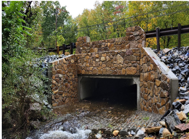
Berkshire Valley Road, Jefferson