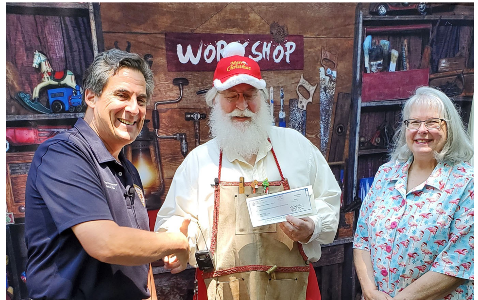
Big Red Santa Workshop