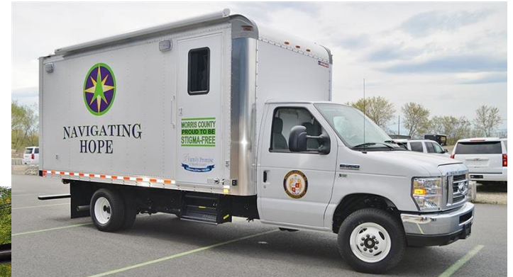
Navigating Hope vehicle