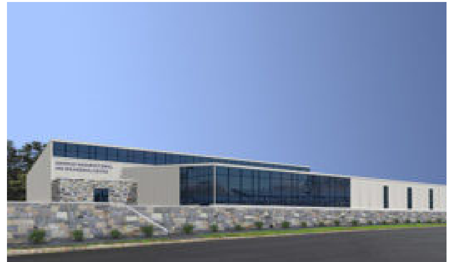
Career Technical Center rendering