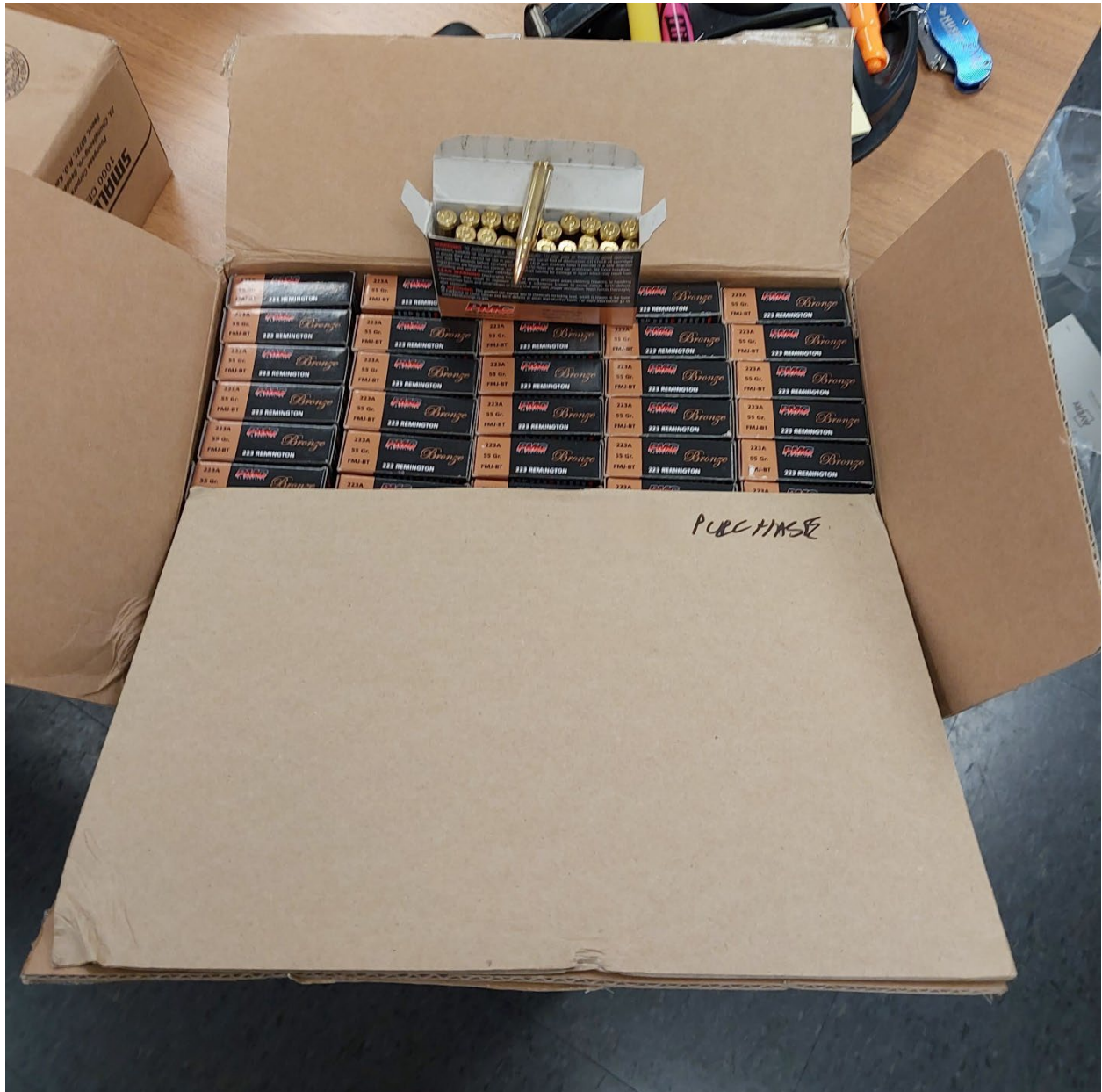
Picture C: Case of .223 caliber rifle ammunition, purchased from Butch's Gun World on June 6, 2024