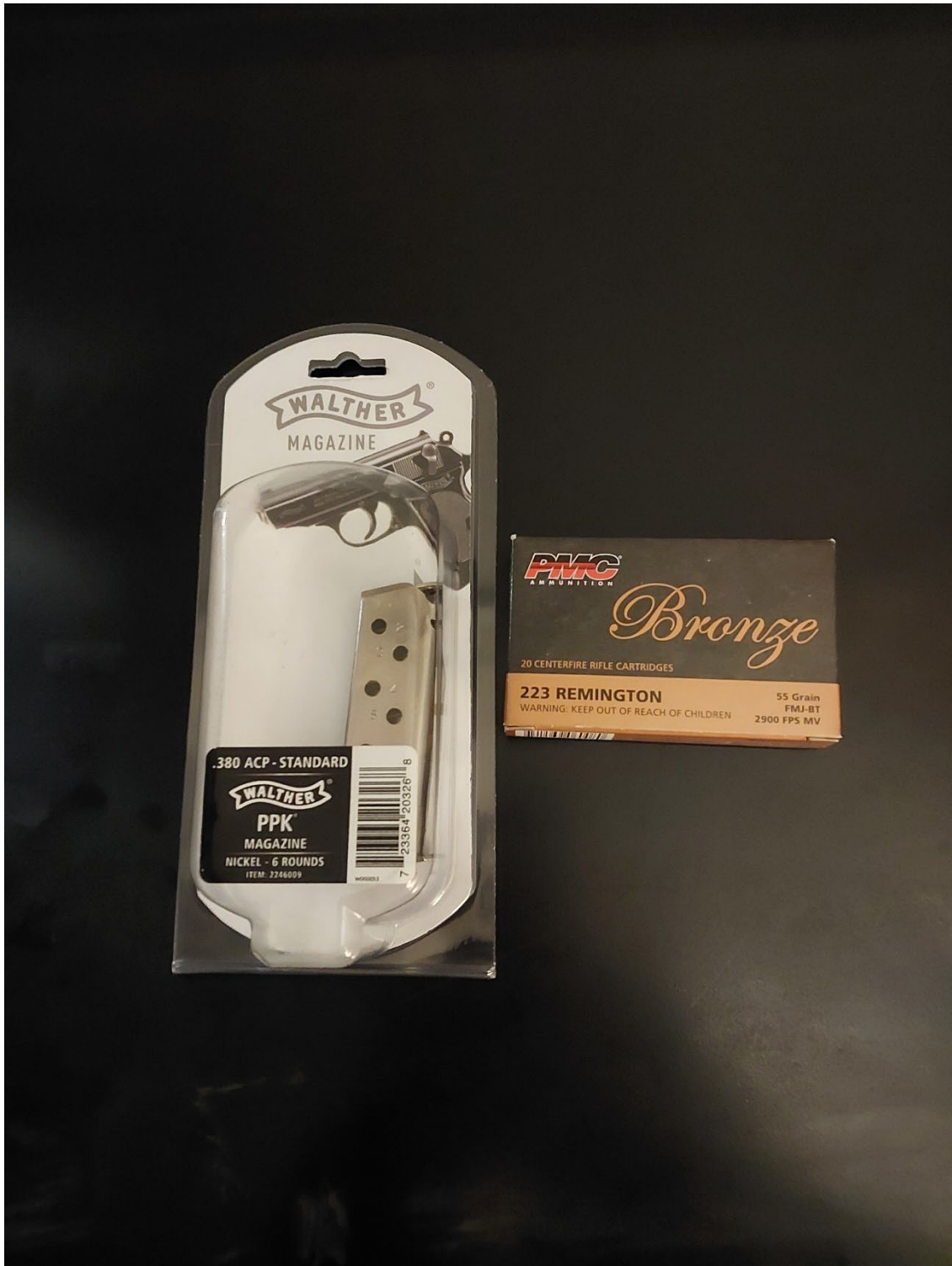
Picture A: Magazine and box of .223 caliber rifle ammunition sold by Butch's Gun World on March 18, 2024